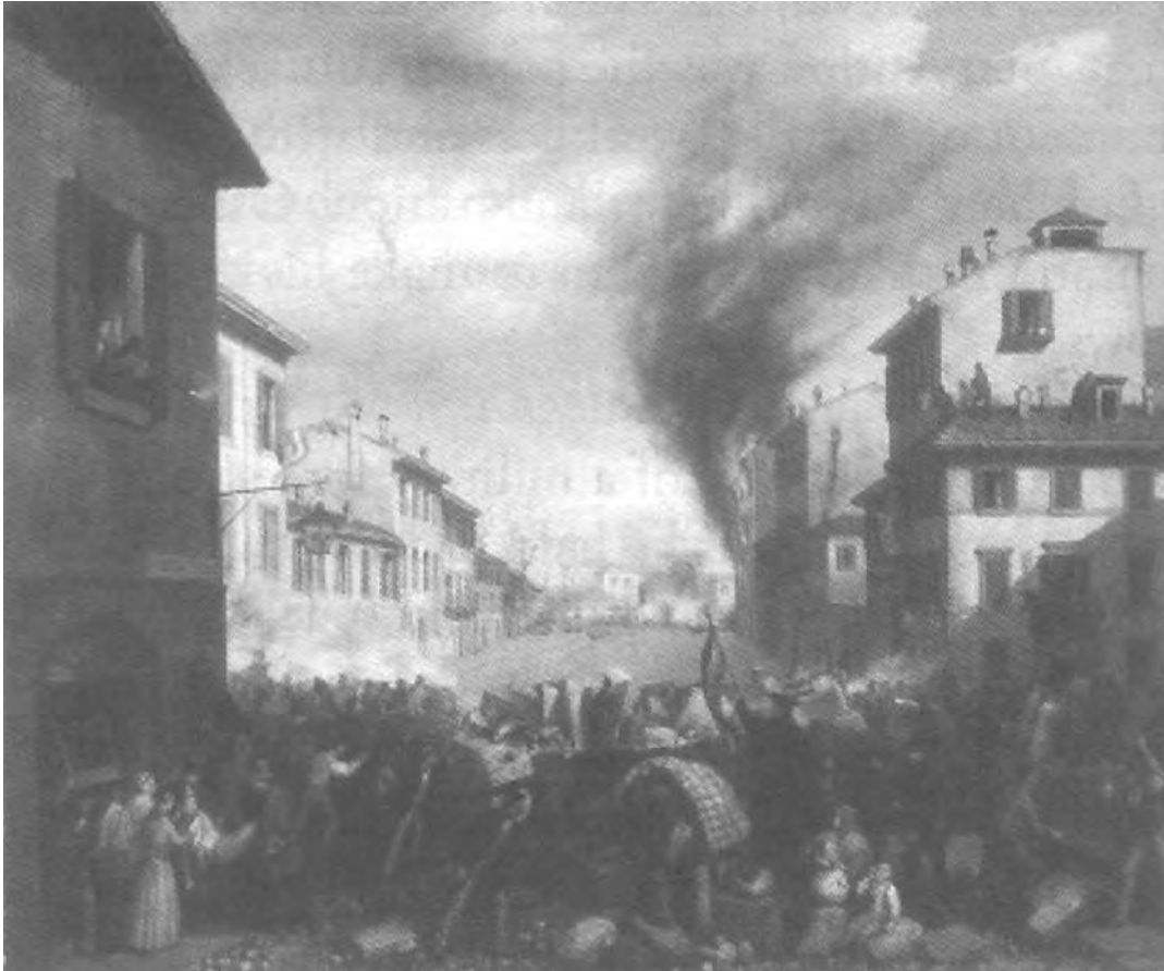
A street battle during the Milan uprising, March 1848.