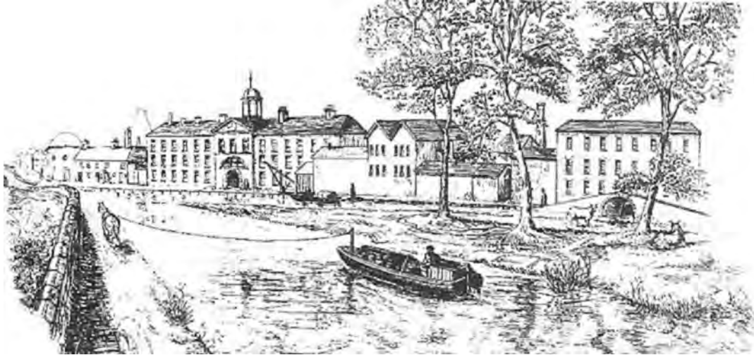
An illustration of Wedgwood's pottery works at Etruria on the banks of the Trent and Mersey Canal, c.1900.

23 Look at the illustration, and then answer the questions which follow.