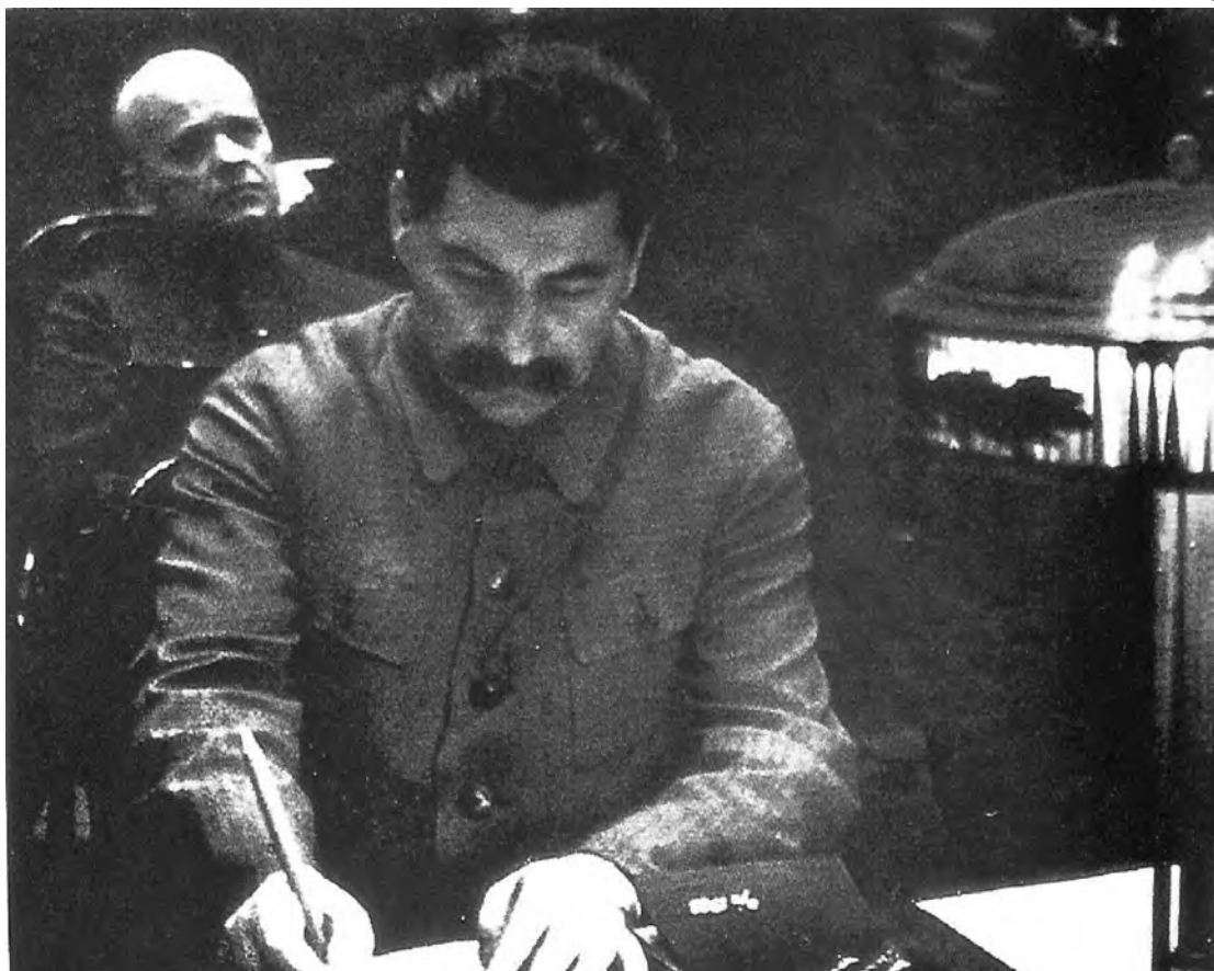
A photograph of Stalin signing death warrants. It was taken in the 1930s.

12 Look at the photograph, and then answer the questions which follow.