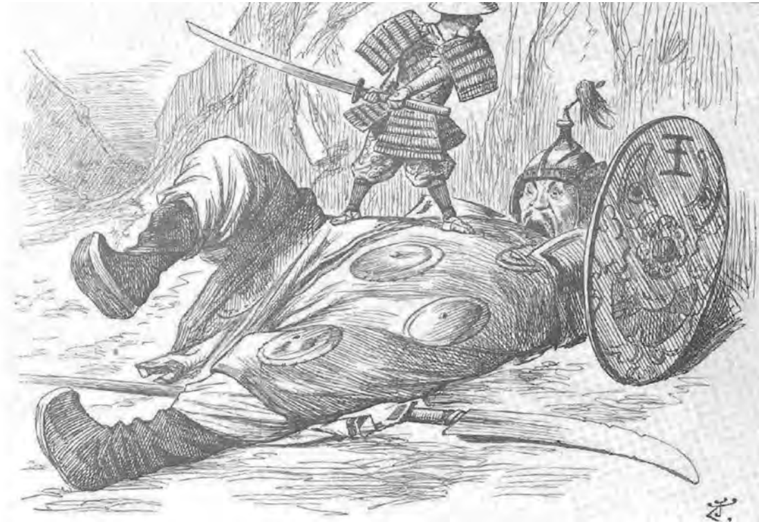
An illustration referring to the Japanese victory over China in 1895.