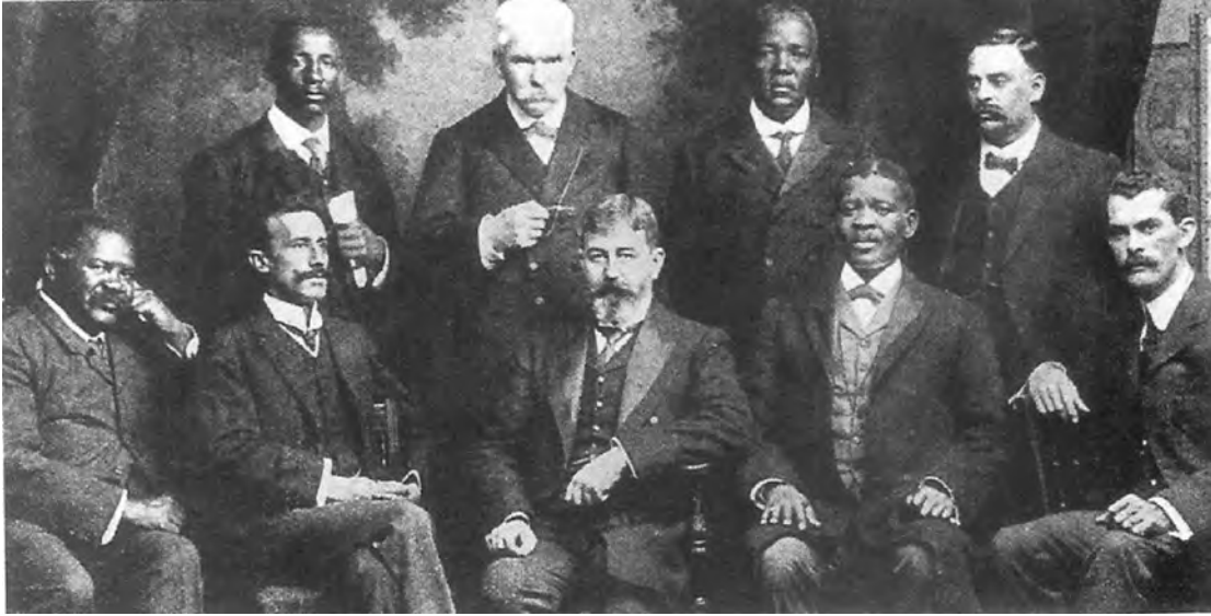
A photograph showing a South African deputation to Britain, 1909. The deputation was seeking full democratic rights for all South Africans.

17 Look at the photograph, and then answer the questions which follow.